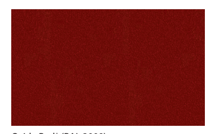
Oxide Red† (RAL 3009)