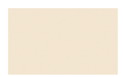
Cream (RAL 1015)