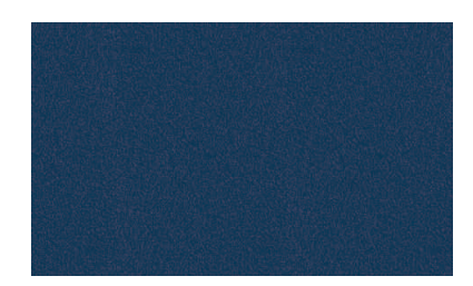
Sargasso (RAL 5003)