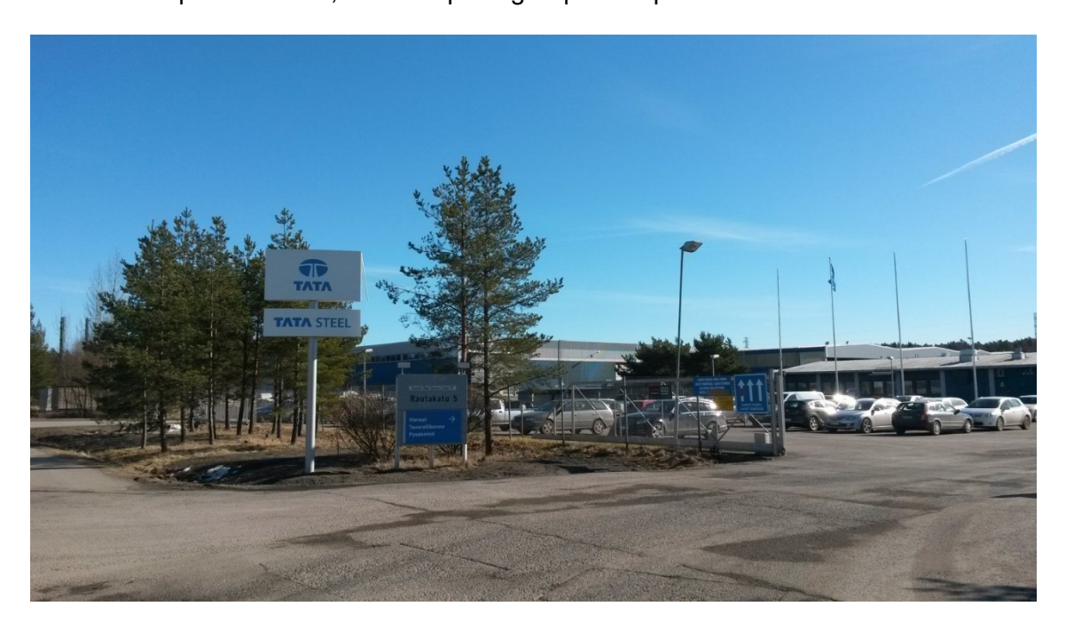
Please note; "movement of materials separated from humans"