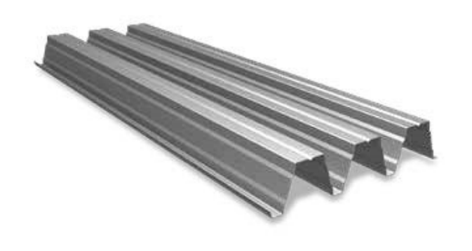
Figure 1 Deep deck 128R.930

Our dedicated and experienced technical team are available to help develop a specification for your project and assist with project specific advice to ensure that all design aspects of the chosen deck system meet your project requirements.