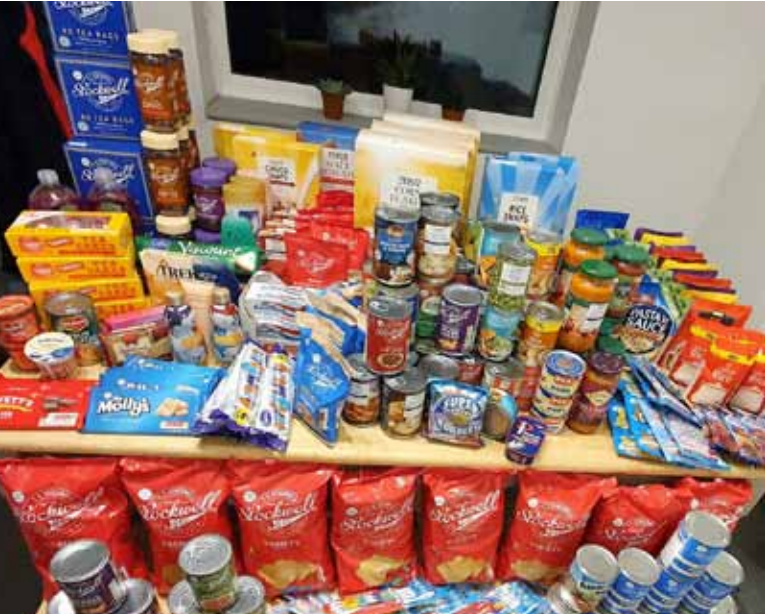
The appeal will urge listeners and community members to donate to their local food bank