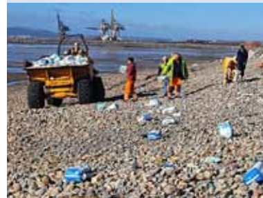
CLEAN-UP AT MORFA BEACH Steel Heroes to beach heroes