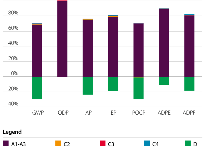
Figure 4 LCA results for the deck profile 100%

The exception, with regard to the end-of-life credit given to steel scrap after the use stage in Module D, is the ODP indicator. This particular impact score is a positive value and does not contribute a reduction to the total results as do the other listed impact categories. This Module D burden comes from the allocation methodology used in the worldsteel model for calculating the 'value of scrap'.