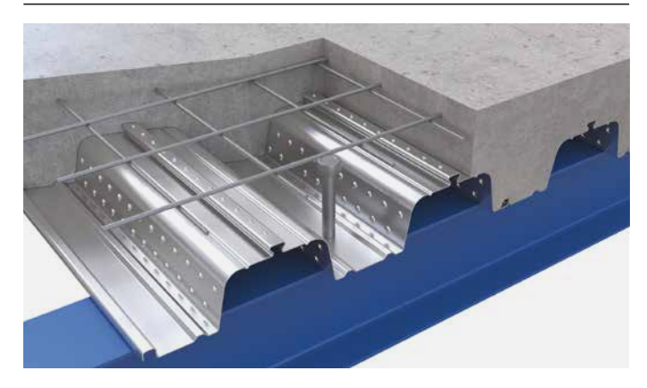
Figure 1 ComFlor® 80 steel deck profile

Composite slabs are commonly used in the commercial, industrial, leisure, health and residential building sectors because of the speed of construction and general structural economy that can be achieved. The ComFlor® steel deck product is specifically designed for rapid installation of flooring and to facilitate lower mass buildings with long clear span composite concrete floors. Large areas of ComFlor® can be easily craned into position and in excess of 400m<sup>2</sup> laid by one team per day. With minimal mesh or fibre reinforcement and pumped concrete, the finished floor can quickly follow, and the completed ComFlor® slabs offer a high level of fire resistance, which in most cases, dictates the minimum slab depth. The Colorcoat FD® 170 variant makes it an ideal choice for multi-storey car parks or any applications where the soffit is exposed.