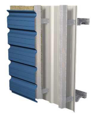
Figure 1 Trisobuild® built-up horizontal wall system

Trisobuild® built-up horizontal wall systems comprise of a Colorcoat® pre-finished steel trapezoidal liner profile, a spacer system, an insulation layer and a Colorcoat® pre-finished steel external weathering profile (see Figure 1). The Trisobuild® systems incorporate a range of Tata Steel profiles and a package of Platinum® Plus pre-approved, reputable highend components that provide tested solutions from both roof and wall constructions together with solutions for fire resistance and acoustic reduction and absorption. Our dedicated and experienced building envelope technical team are available to help develop a specification for your project and assist with project specific advice to ensure that all design aspects of the chosen cladding system meet your project requirements. The wool insulation is classified as A1 to EN 13501-1 [8] and the Trisobuild® system is approved by the Loss Prevention Certification Board (LPCB) [9].