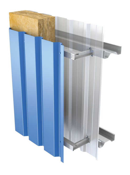
Figure 1 Trisobuild® built-up vertical wall system

Trisobuild® built-up vertical wall systems comprise of a Colorcoat® prefinished steel trapezoidal liner profile, a spacer system, an insulation layer and a Colorcoat® pre-finished steel external weathering profile (see Figure 1). The Trisobuild® systems incorporate a range of Tata Steel profiles and a package of Platinum® Plus pre-approved, reputable highend components that provide tested solutions from both roof and wall constructions together with solutions for fire resistance and acoustic reduction and absorption. Our dedicated and experienced building envelope technical team are available to help develop a specification for your project and assist with project specific advice to ensure that all design aspects of the chosen cladding system meet your project requirements. The wool insulation is classified as A1 to EN 13501-1 [8] and the Trisobuild® system is approved by the Loss Prevention Certification Board (LPCB) [9].