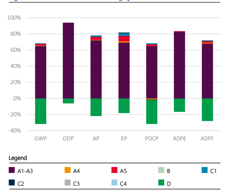
Figure 4 LCA results for the cladding system

Module D values are largely derived using worldsteel's value of scrap methodology which is based upon many steel plants worldwide, including both BF/BOF and EAF steel production routes. At end-of-life, the recovered steel cladding is modelled with a credit given as if it were re-melted in an Electric Arc Furnace and substituted by the same amount of steel produced in a Blast Furnace [24]. This contributes a significant reduction to most of the environmental impact category results, with the specific emissions that represent the burden in A1-A3, essentially the same as those responsible for the impact reductions in Module D.