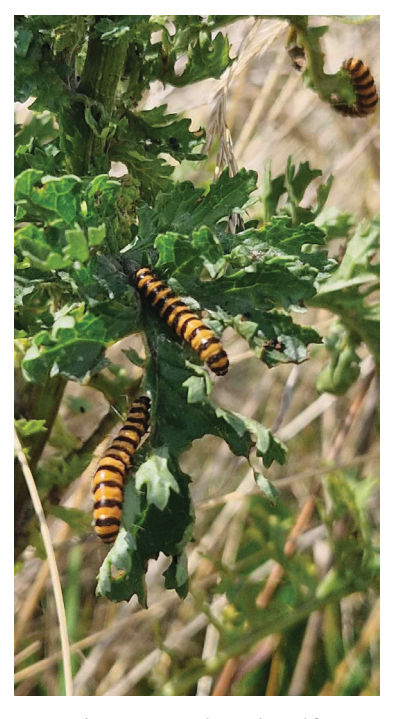
Tata Steel UK, in partnership with Buglife Cymru and Runtech, are creating new grassland areas to invite more wildlife and invertebrates onto site

The business has chosen its winners and it looks forward to announcing these in September when the schools go back. A big thank you to everyone involved!