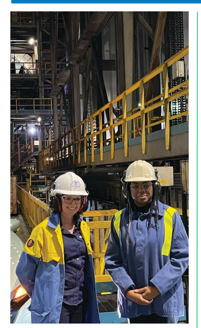
Secretary of State for the Department of Business and Trade, Kemi Badenoch MP