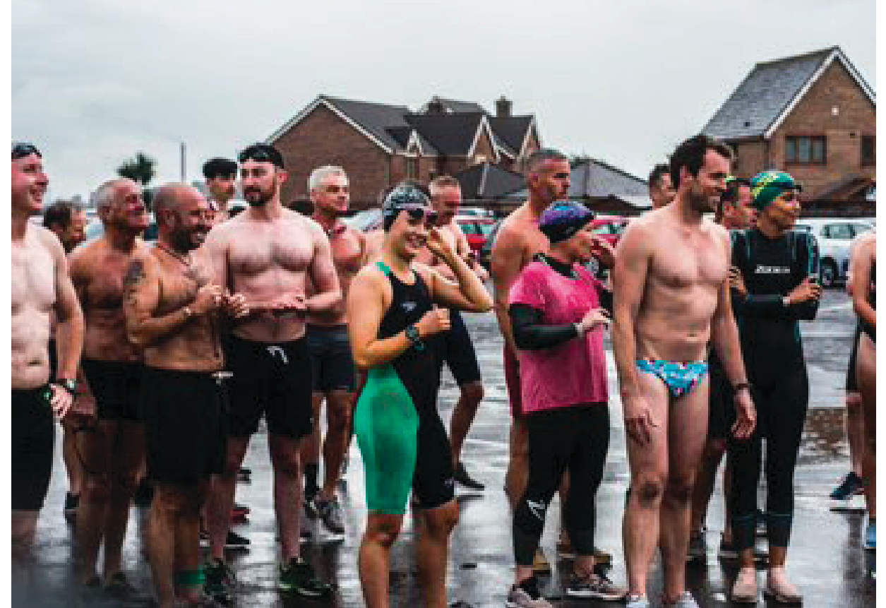
It was all smiles in 2021

*a panné is a method for coating your meat, fish, shellfish or vegetables in breadcrumbs.