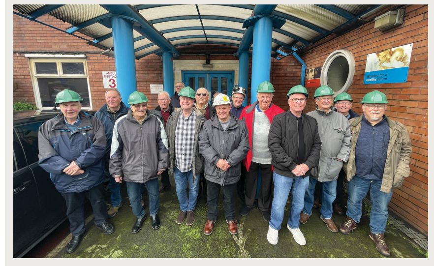
Band of brothers. With 500 years of experience between them, the visit brought back plenty of memories for

Earlier this year, a group of retired steel workers returned for a visit to their old stomping ground in Port Talbot's Hot Mill.