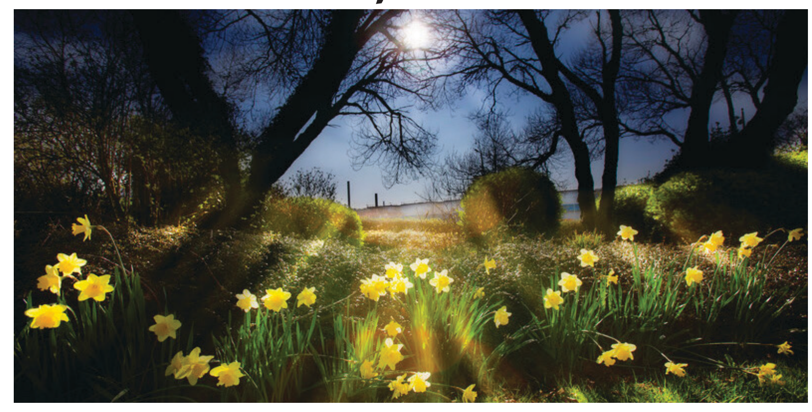
Tata Steel UK Environment team have been working hard to address feedback from the community

Back in June, Tata Steel launched a public survey to get feedback on the business's environmental complaints and claims process. The aim of this survey was for the business to listen to its neighbours and to understand where it can improve the complaints and claims process.