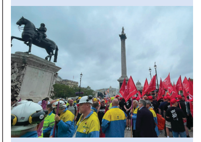
THE FUTURE OF UK STEEL Hundreds take to the streets

Hundreds take to the streets in support of steel