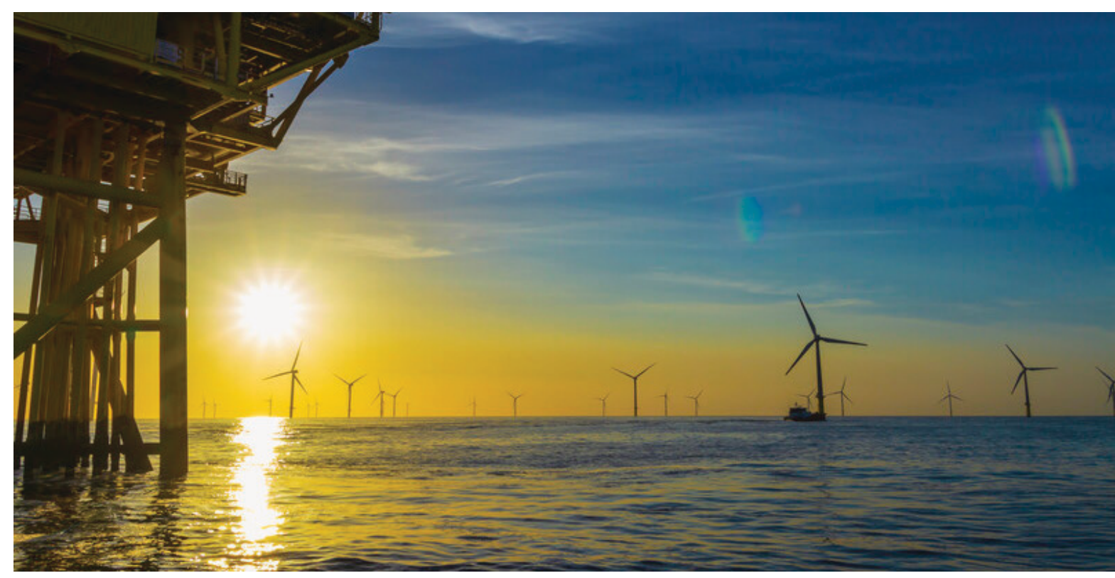
Both a green freeport and a decarbonised steelworks have exciting, shared potential opportunities for serving nationally significant energy infrastructure

In March, the UK and Welsh governments announced that Port Talbot, specifically the ABP Port adjacent to Tata Steel UK, would be included in the Celtic Freeport - one of two Freeports announced in Wales.