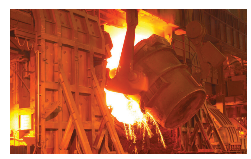
The Basic Oxygen Steelmaking Plant, the heart of Port Talbot works

Did you know: The BOS plant in Port Talbot is one of the biggest recyclers in Wales, taking in many tonnes of scrap steel packaging every day. Steel's magnetic properties make it