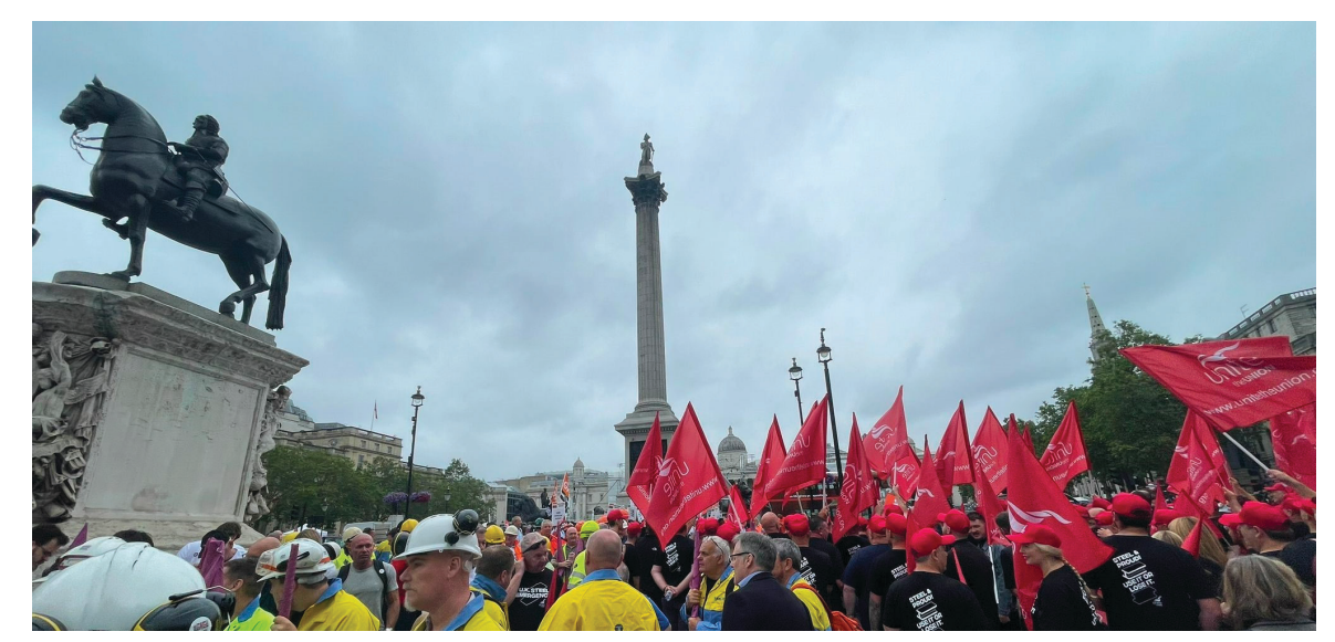
Workers have highlighted the threat to the UK's £2.4bn sector, which employs 34,500 people directly and supports another 43,000 in supply chains

trade body UK Steel, warned Britain was "lagging behind" rival countries in moving to green steel.