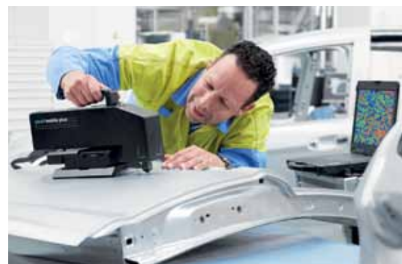
Roughness measuring of parts to indicate galling

A high level of tool pollution is often evident where high friction occurs during processing. There are two types of tool pollution: adhesive sheet wear and abrasive sheet wear. The former refers to the adhesive transfer of zinc particles, which causes galling, while the latter is the scraping off of zinc particles. Galling results in scratches on the surface of the steel, and the removal of zinc particles causes pimple defects, both affecting the appearance of the component after painting.