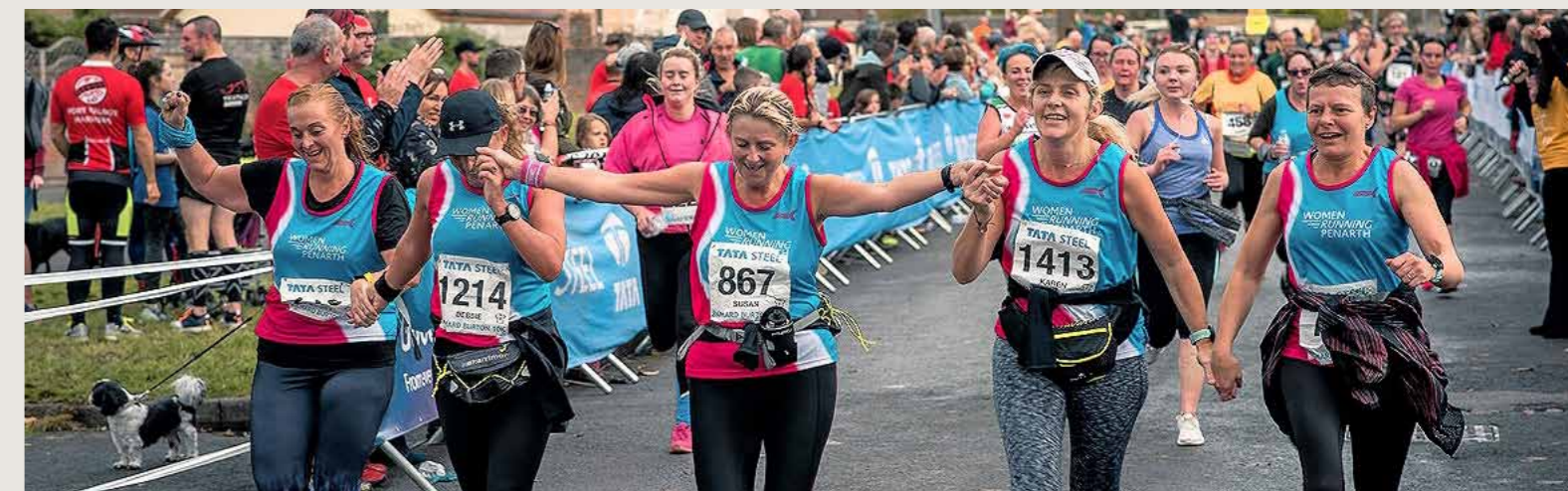
Many ran in teams, sharing in the glory and elation crossing the finish line together

Charity and community group representatives were welcomed to our Academy building for an evening of celebration, where more than £15,000 from the Tata Steel Richard Burton race was donated. The race took place in Cwmafan on Sunday 4 November and saw more than 1,800 runners in the main race and 350 children take part in the mini-miler. Representatives from groups including the Port Talbot YMCA, Scouts, Cwmafan and Ponrhydyfen RFC and