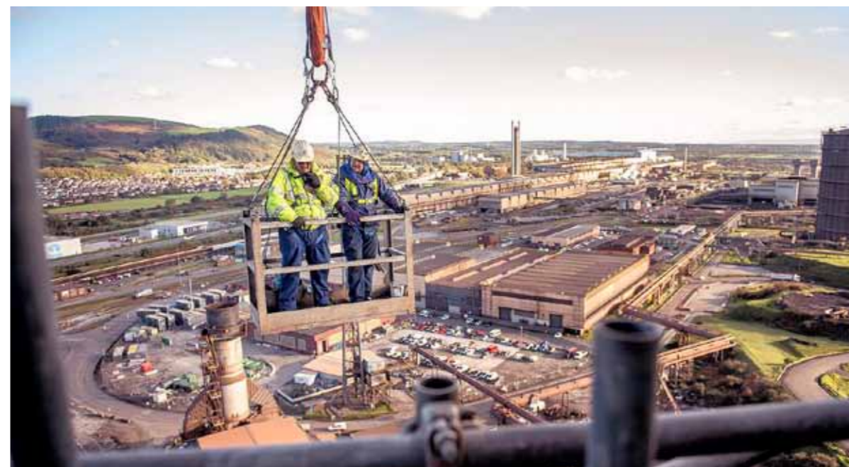
The project has seen our workforce and contractor partners go above and beyond

and provide a smoother profile to aid the descent of the raw materials.