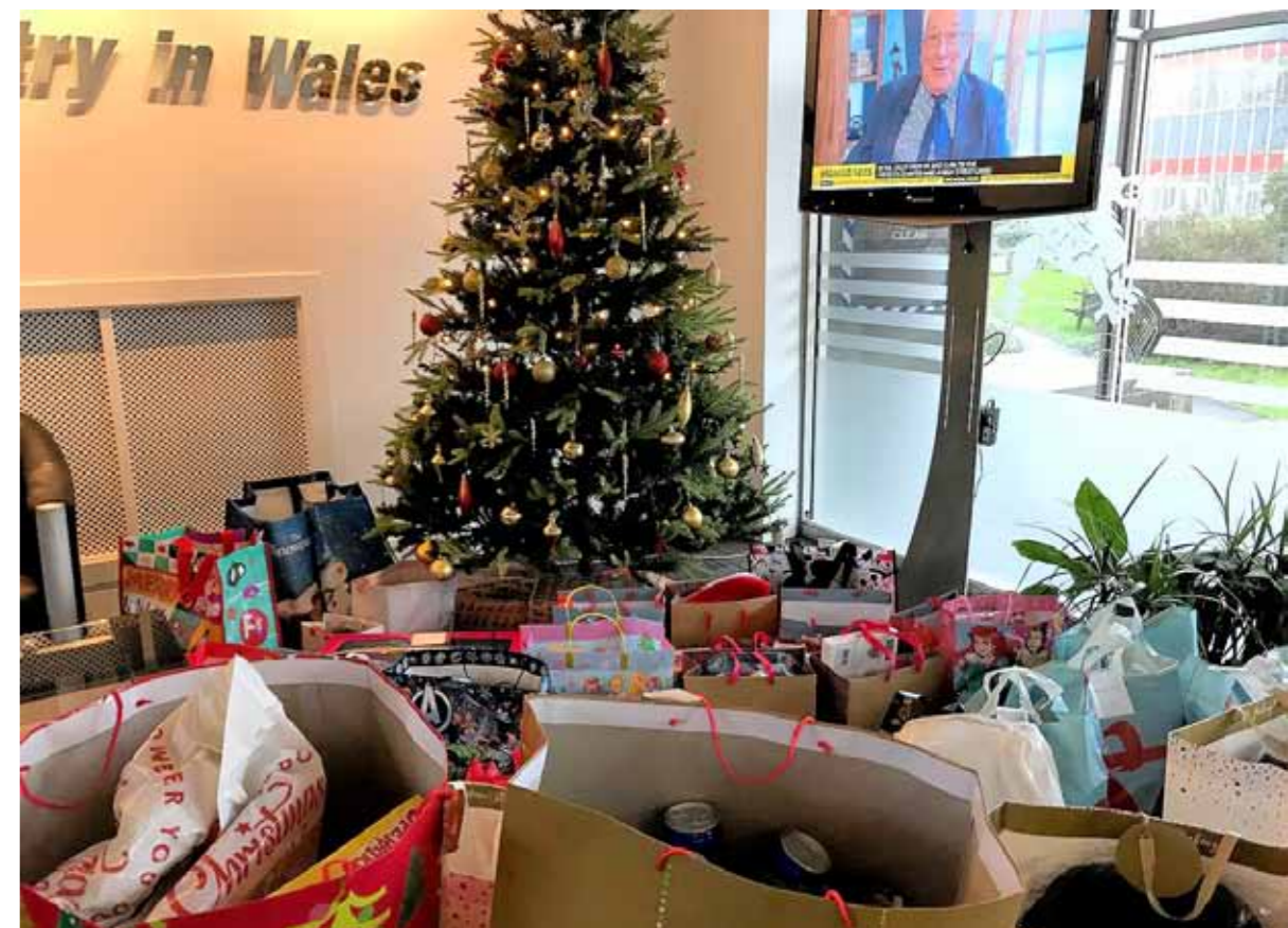
Gifts bought with generous donations from staff at the steelworks

Talbot were given a business donation to purchase food for their annual Christmas lunch and presents for all attending. This is the fifth year the business has given and it was great to see that the hard working nurses organising and giving up their own Christmas day for others were recognised across local media outlets. Thrive Women's Aid in Port Talbot had a treat when it received Christmas-themed goody bags to hand out to those attending its Children and Young Persons service and for the children of its service users. Happy New Year!